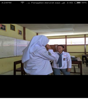
Figure 1: Drama Performance

After some topics practiced and elaborated by teacher researcher to students, then students are grouped into some small groups, they are asked to discuss one topic then have to perform it in the class, then it is recorded to be analyzed referred to rubric of speaking aspects of pronunciation, grammar, fluency, vocabulary, and comprehension. Before, students are provided with the topics, then they choose with topics to be practiced and acted out. Time is allocated for them to rehearsal in groups before the performance. In group students are discussing, practicing, answering and act it out. In their performance students are free to say what do they want but suitable to the context and topic chosen. At last, students have to perform their drama. Here are the photo of their performance: